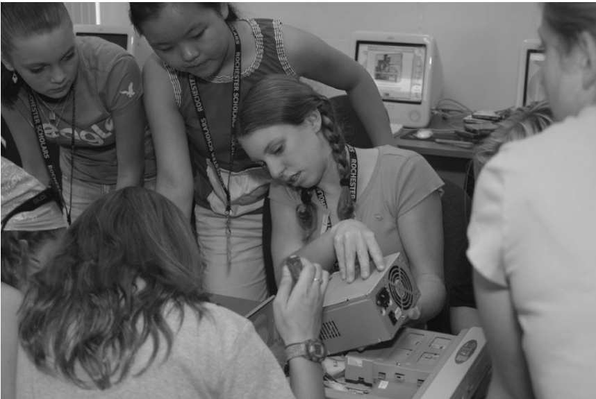
Girl Power! students dismantle a computer for the first time

the New Computer Age" (2000). A thorough study into methods of teaching technology to girls, it exposed the problems with the current violent video game culture, the lack of creativity in the course material, and the male dominance that discourage girls from becoming interested at the early levels. "The commission makes it clear that girls are critical of the computer culture, not computer phobic," said Sherry Turkle, professor of sociology at MIT and co-chair of the commission. "Instead of trying to make girls fit into the existing computer culture, the computer culture must become more inviting for girls." The Rochester Scholars Jr. class took it one step further. We created a supportive all-girls environment to spark their interests and gave them hands-on experiences to keep them wanting for more.