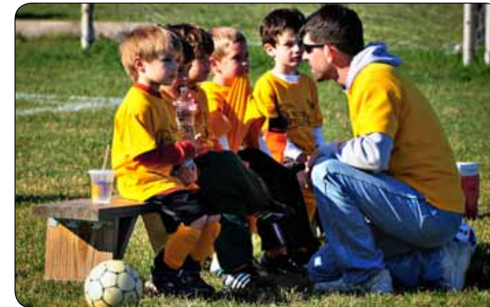
Boutell's teaching continues outside the classroom.

ED.: What is your nonacademic life like? Busy dad with kids going in many directions, I imagine. I see you coach soccer. Do all the kids play soccer? What are the age ranges of your children?